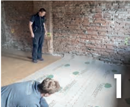
Roll out and adjust TIMBER PROTECT