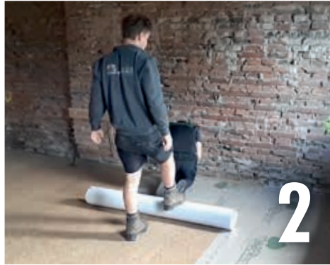
Then roll up again neatly