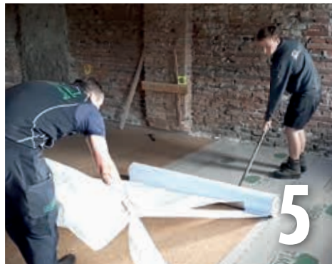
At the same time, smooth out the sheet with a squeegee. Always work towards the end of the sheet to avoid air bubbles and creases.