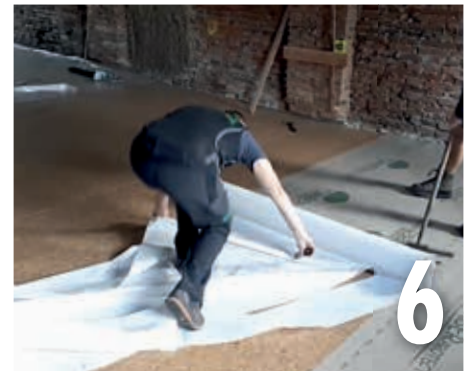
As soon as the backing strip can no longer be handled without creasing, cut off and peel off the backing strip at the short end.