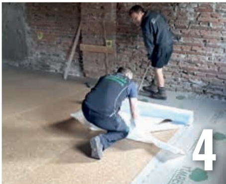
Pull off the backing strip. IMPORTANT: The roll must be rolled out and lying on the ground while the backing strip is peeled off.