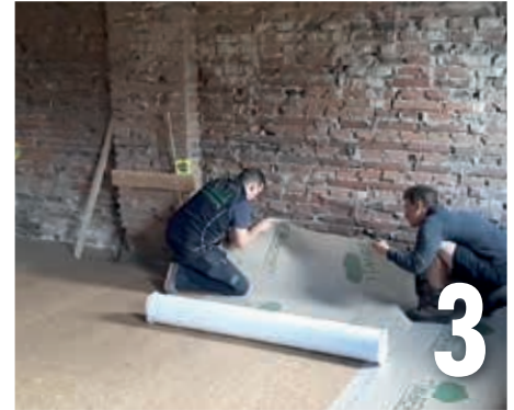
Peel off the backing strip at the start of the roll and fix TIMBER PROTECT in place